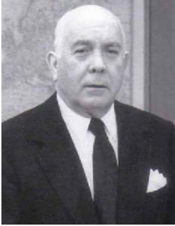
Archon Spyros P. Skouras Motion Picture Pioneer and President of 20th Century Fox

Many notable individuals within the Christian community are Archons.