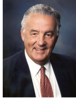
Archon Paul S. Sarbanes United States Senator