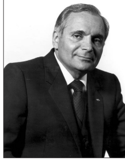
Archon Michael Bilirakis Member of the U.S. House of Representatives