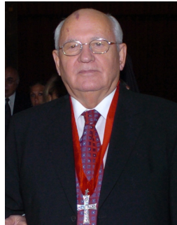
Archon Mikhail Gorbachev Former Soviet Union Leader