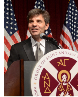
Archon George Stephanopoulos Former White House Communications Director and News Anchor, ABC