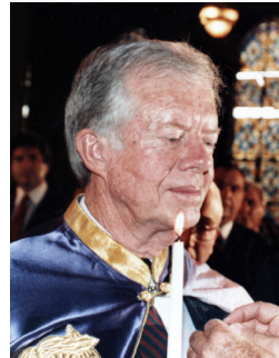
Archon President Jimmy Carter US President